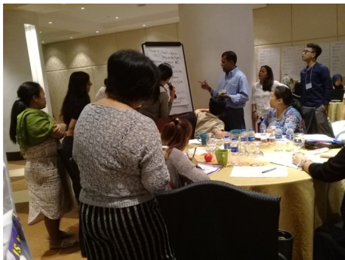
“Campaign for Decent Work” complements the call for a rights-based and gender-responsive GCM.

The conference organized by the Migrant Forum in Asia (MFA) and the International Domestic Workers Federation (IDWF) was held in Manila on October 22-24, 2017. Some 50 domestic workers, support organizations and parliamentarians who came to the conference support the call of domestic workers in a statement; “Recognize Us and Listen to Us: Towards Achieving Decent Work for Domestic Workers”