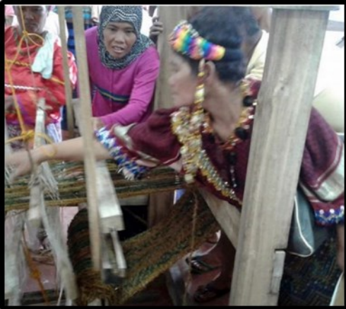
Bagobo tribal woman recalls their traditional weaving skills.

Two social enterprises were started during the period. The production of mats and rugs in Davao and ginger tuber growing and candy making in Lanao allow women to work in their homes or in the communities where they live.