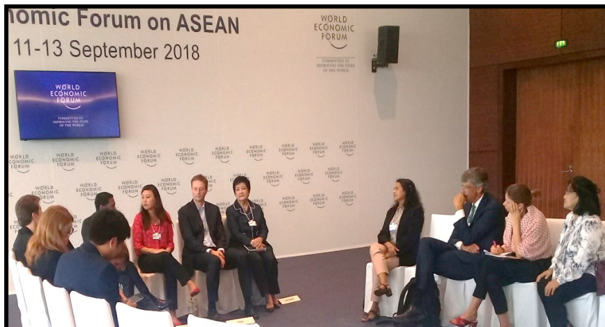
(Schwab Foundation) Social Entrepreneurs gather at a Private Conversation on “Innovation Under Stress”.