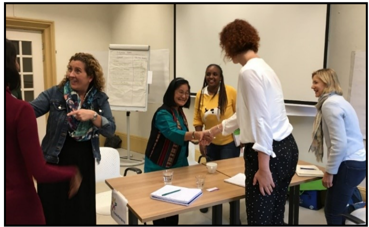
How did the pitch go with Friesland Campina?