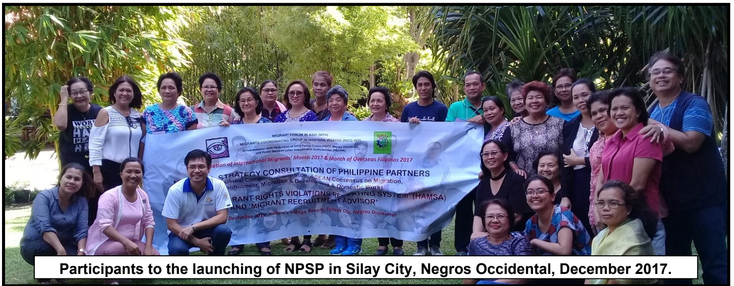
Participants to the launching of NPSP in Silay City, Negros Occidental, December 2017.

An innovative approach to a more effective savings mobilization with the “Migrant Savings and Alternative Investments-MSAI” was developed and is being campaigned for. is the National Provident Savings Program. NPSP is an integrated savings mechanism that brings in existing savings-pension institutions, such as the Social Security System (SSS), Pag-ibig Provident Savings and Housing, and PhilHealth while value added windows that address particular situation and behavior of migrant workers.