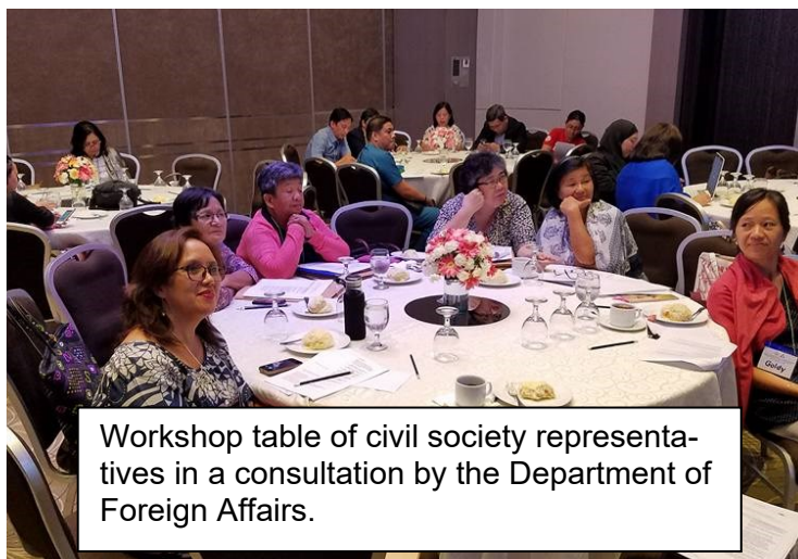
Workshop table of civil society representatives in a consultation by the Department of Foreign Affairs.

Asia Regional Conference: “Enhancing Collective Advocacy, Action and Empowerment of Domestic Workers.