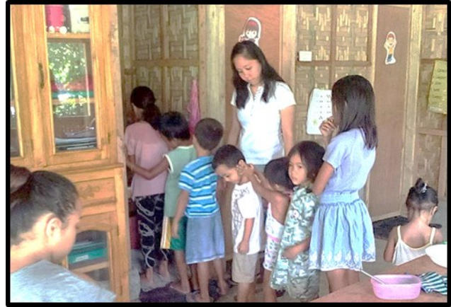
Kids queue up to wash hands before and after eating.