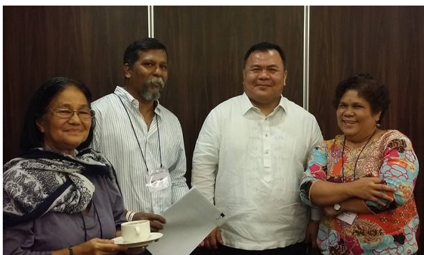
Ambassador Foz & CSO representatives, Unlad Kabayan, MFA, CMA.

Further study and proposals were made in a broader forum of “Philippine Multiple Stakeholders in Migration” organized by the Department of Foreign Affairs (DFA).