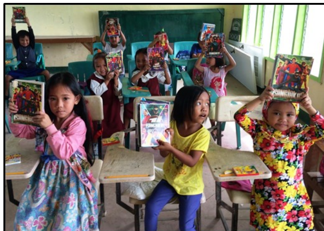
School kids in Bubong, Lanao del Sur receive packs of school supplies.

Many Maranao families are supported by overseas remittances, mostly from the Middle East, continue to be a significant source of income. According to government, the rehabilitation of Marawi may take at least five (5) years which includes re-construction of roads, bridges, government buildings and other infrastructure, building of more permanent housing for displaced population, new infrastructures such as ports and an airport, and economic reconstruction, estimated to cost P75 billion. About P1.8 billion in assistance for income opportunities has been spent for 1,700 families in evacuation centers and 11,100 families dispersed in 8 regions.