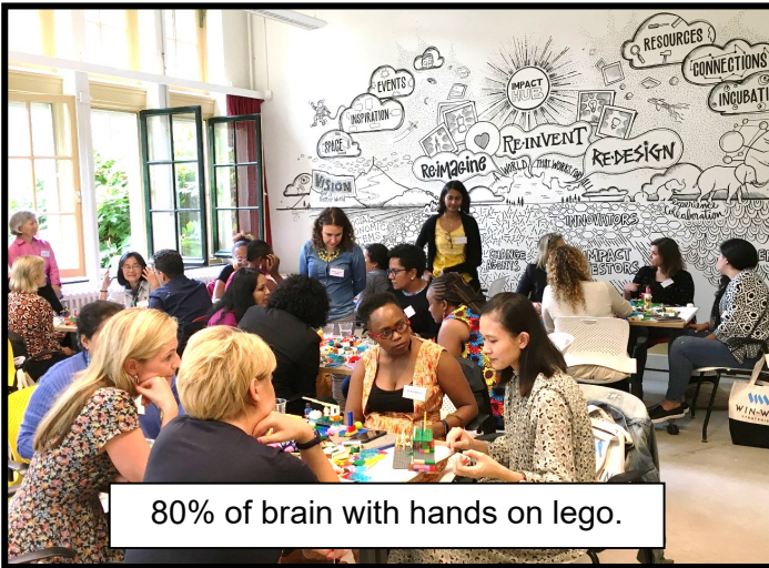
80% of brain with hands on lego.