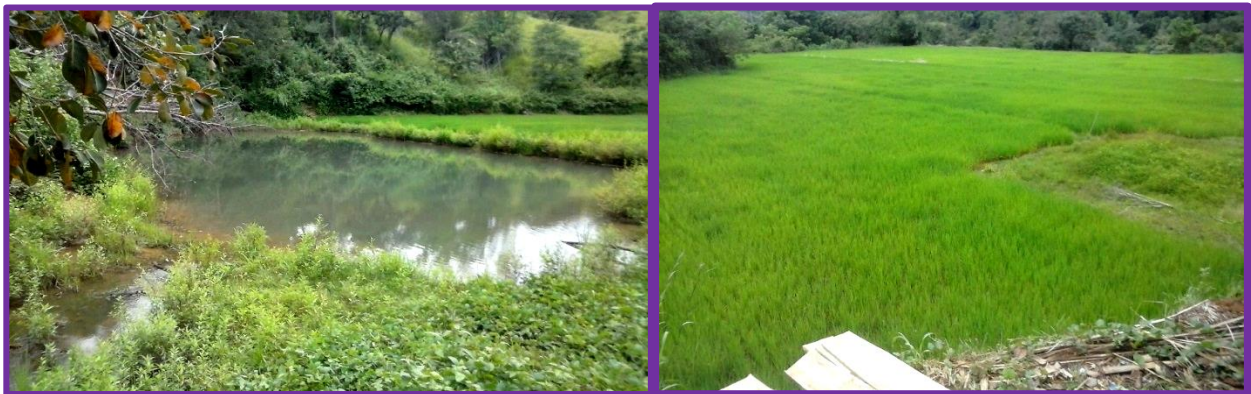
Irma’s Fish & Rice Farm