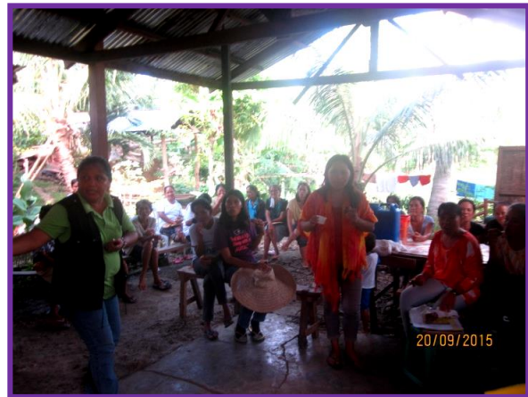
SFWA quarterly meeting reviews progress of work.

Livelihood Monitoring Teams of AEWA and SFWA continued to visit beneficiaries to mark progress, assist/advice in case of problems, and to collect the “gift” to the next woman in line. The 3 rd batch received their “gifts” in December 2015 – bringing to 107 the total of “gift” recipients, 71 in Albueria and 36 in Isabel. Both organizations kept the carpentry kit but sold the chainsaws to commercial operators and used the sales to augment capital for their respective businesses.